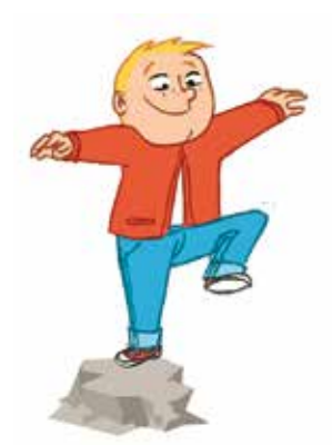
... control my movements and improve my sense of equilibrium