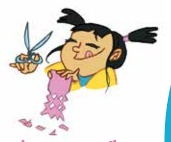
... improve my fine motor skills